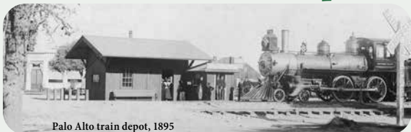
Palo Alto train depot, 1895

Please take the time to renew your PAHA membership now at pahistory.org/membership or by mail to Palo Alto Historical Association P.O. Box 193, Palo Alto, CA 94302.