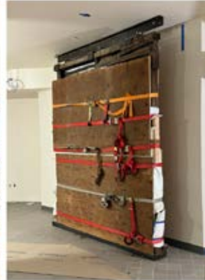
The recent installation of the historic Juana Briones adobe wall