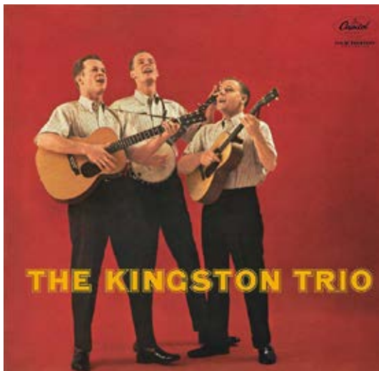
First Album Release: June 1, 1958 Label: Capitol Records

The Kingston Trio, formed in Palo Alto, were not just a musical group; they were cultural architects of the late 1950s and early 1960s. This dynamic trio, with their infectious melodies and harmonious tunes, catapulted folk music into the mainstream, transforming the musical landscape in several profound ways: