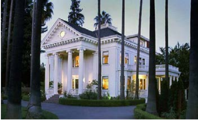
The Squire House at 900 University Avenue

Those who drive back and forth to Highway 101 on University Avenue pass by an imposing Classical Revival situated on a palm-lined half-circle driveway. It's known as "the Squire House," as if owned by a country squire other than Leland Stanford, whose original country house was torn down in 1959.