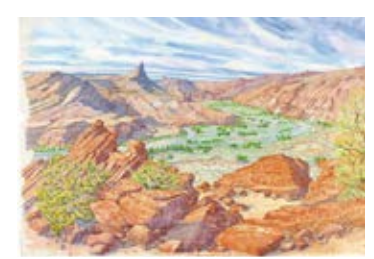
Watercolor by Tony Foster

https://www.cityofpaloalto.org/Departments/Community-Services/Arts-Sciences/Junior-Museum-Zoo.