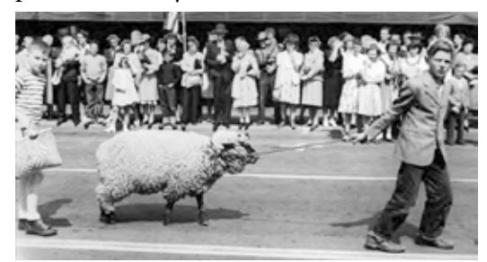
Boy walking his pet sheep in parade, 1944

Palo Alto's May Fete Parade has been around for nearly a century, even predating the Macy's Thanksgiving Day Parade in New York City (by 6 months). The first Palo Alto May Fete parade was held in 1924 when the Community Center Committee (operating out of the Community House – the first community center in Palo Alto) announced the May Fete Parade was to be an official city event. The parade was a much-anticipated annual community celebration up until the pandemic, last year.