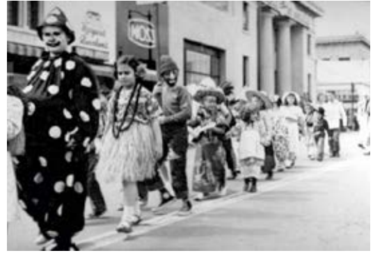
Children in costume walking down University Avenue, 1951

Palo Alto's May Fete Parade has been around for nearly a century, even predating the Macy's Thanksgiving Day Parade in New York City (by 6 months). The first Palo Alto May Fete parade was held in 1924 when the Community Center Committee (operating out of the Community House – the first community center in Palo Alto) announced the May Fete Parade was to be an official city event. The parade was a much-anticipated annual community celebration up until the pandemic, last year.