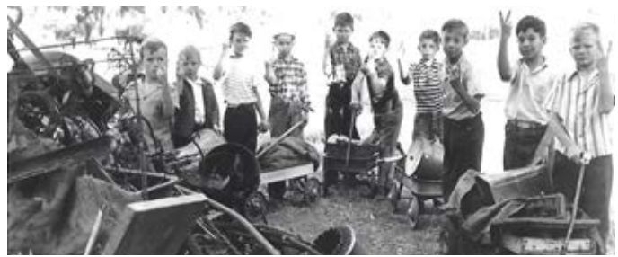
1941 Scrap Metal Drive with boys giving the Victory sign

My father was the Air Raid Warden for our block, which at the time included only our house and our greenhouses. The city would hold air raid drills at night. I remember hearing the siren and my dad going outside to walk the block with his flashlight. His job was to make sure there were no lights on in our neighborhood so the Japanese airplanes could not identify targets.