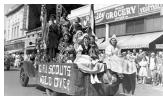
Girl Scouts on a float on University Avenue in 1938

This year, the City held a "Reverse Parade" in which Palo Altans could decorate their homes or businesses in the theme of "What a Wonderful World" and register their address online for people to drive by and view. The concept got off to a slow start with only 6 businesses (mostly city operated buildings) and 11 homes registering. It is hoped that next year the traditional parade will be able to take place again.