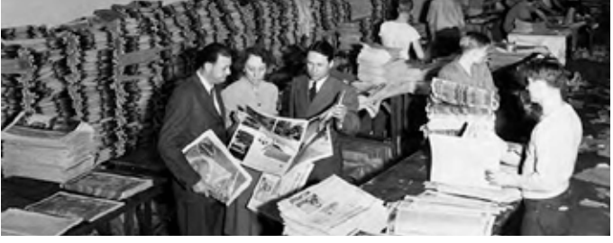
Palo Alto Times production room, 1941

In a way, I feel the Times was a victim of the generosity of the owners. They set up one of the first Employee Stock Ownership Plan (ESOP) in California whereby the employees could, through payroll deductions, buy stock in the company. Eventually the employees had control of the company. However, soon thereafter, the Chicago Tribune made an offer for the stock at an attractive price that a majority of shareholder-employees agreed to, ending local ownership.