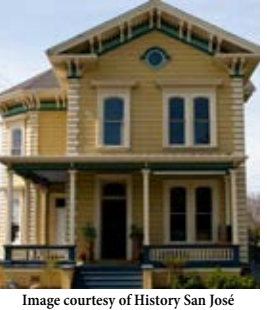
at Kelly Park

At San José's History Park , visitors can take a step back in time. Maintained by History San José at Kelly Park, the historical and cultural campus features 19 partner organizations, each of which tells the story of its own role in the city's development. The 14-acre site, with its paved streets, running trolleys, and a café, offers a wealth of activities and experiences. Located at 1650 Senter Road, the park is free and open to the public Mon-Fri, 12-5pm, Sat-Sun, 11 am-5pm. Some special events charge a fee. For up-to-date information on History Park and pandemic protocols, call (408) 287-2290 or visit the website https://www.historysanjose.org/wp/