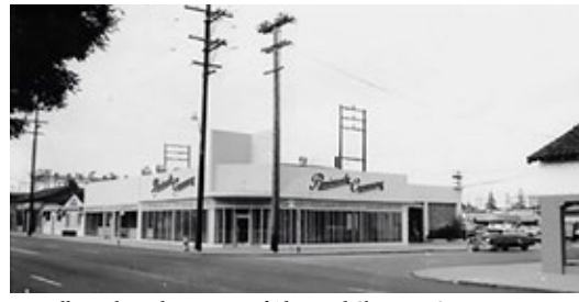
Milk Bottling Plant corner of Alma and Channing Streets c.1950s

While milk sales waned in the 1960s, ice cream sales grew. The plant turned out as much as 3 million gallons of ice cream a year and more than 200 flavors from 1957 to 1994. They used only the best ingredients including Gimbels' peppermints from San Francisco and Marshall strawberries from Washington State, and were always coming up with new flavors such as "patriotic peach" for the centennial in 1976. The well-known label could also be found in local Bay Area supermarkets.