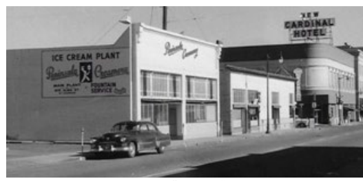
The Ice Cream Plant and adjacent "Fountain" on Hamilton Avenue c 1950

To lower costs, the Creamery converted their delivery employees into independent contractors and sold them their trucks. This worked for a time but by the 1960s most people were picking up their dairy products at the grocery store. In addition, Stanford University decided to build the Stanford Shopping Center where the dairy ranch was and the Peninsula Creamery had to move their herd to the south bay. The milk plant operated at the Alma Street location until its closure in 1985.