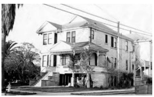
First hospital in Palo Alto, ca. 1900

Ultimately, it was a perfect storm that led to the typhoid fever outbreak. In late 1902, a family outside of Palo Alto contracted typhoid fever from a visiting cousin. Their