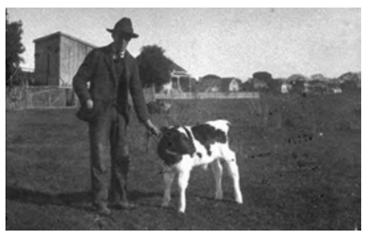
Early dairy farmer in Palo Alto, ca 1900

For younger generations, it would be odd to think they would know who delivers their milk. Most of us get our milk from the shelf at a grocery store, never meeting the farmers and distributors who handle our food. We