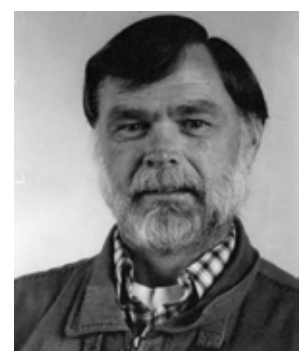
Joe Melena, local photographer

Joe's work as a photographer represents a significant portion of