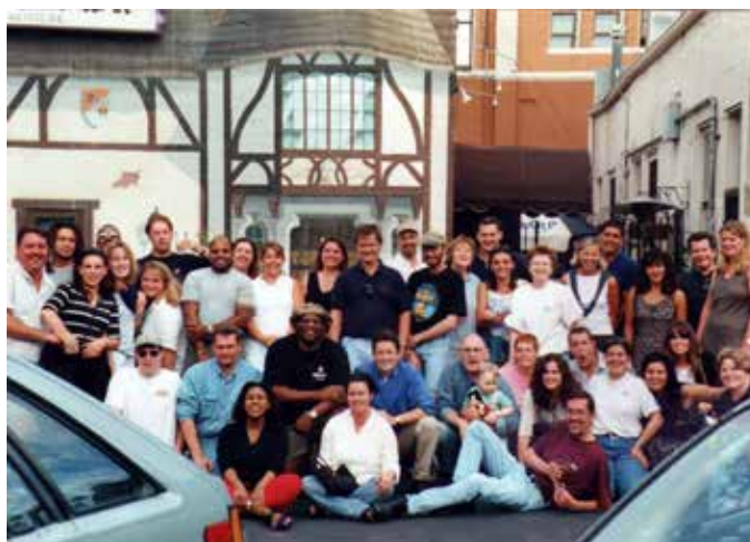
The Crown staff in the mid-1990s.