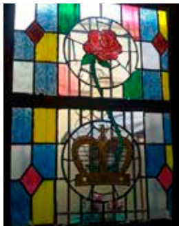
The Crown's stained glass