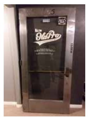
Original door to The Old Pro