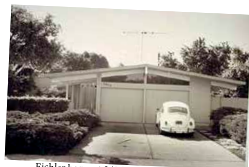
Eichler home at 3454 Greer Road, Palo Alto