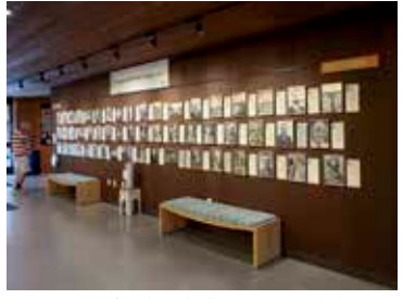
Creators of Palo Alto's Legacy exhibit at Rinconada Library, September 2019

the public. The Legacy project provided public recognition of the people who made significant contributions to the development of Palo Alto from 1894 to 1994. This year's exhibit at Rinconada Library was a popular attraction.