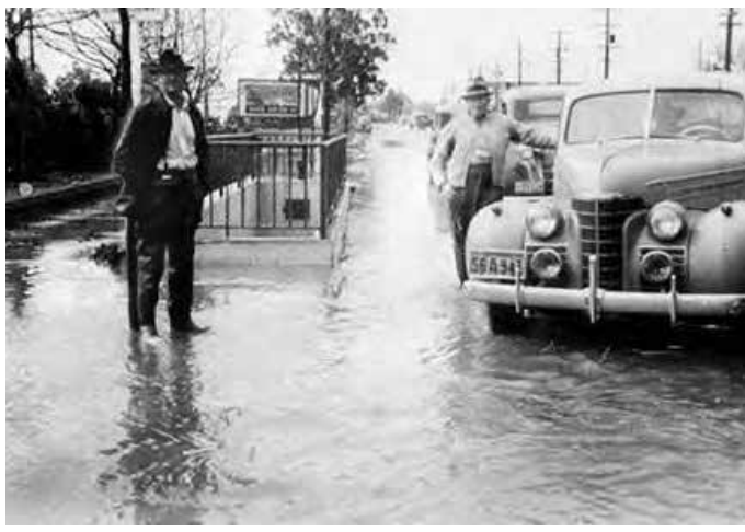
Underpass at Mayfield School during 1940 Flood

neighborhood. Parents could park on El Camino and let their children walk safely down that underpass to cross under to get to school. I believe there was a drive-in restaurant named Bonander's near the eastern side of El Camino as well. The underpasses were plain, but they were a safer route for pedestrians walking across El Camino Real, even in 1950.