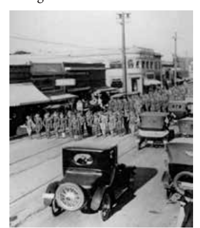
Palo Alto parade celebrating Armistice day, 1918

When the Armistice came on the 11th hour of the 11th day of the 11th month, soldiers from Camp Fremont marched in a parade down University Ave.