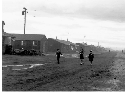
Young children go to school walking on the dirt road between barracks at Tule Lake Camp.