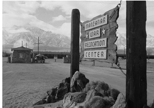
The entrance to the Manzanar internment camp in 1942.