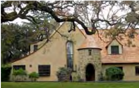
Home on tour

Sunday May 1, 2011, 1-4 pm: ticket required.