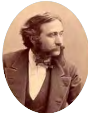
H.H. Bancroft wrote a history of California during the Civil War years.

It should be no surprise that many Californians had somewhat the same attitude in 1861-65. It seems that our state had relatively little influence on the civil war's inception, conduct or outcome. There is a California civil war history website that brags that "...almost no one knows that California had more volunteers per capita in the Union Army than any other state." This statement seemed to me highly unlikely, so I dug deeper into the history and compared state populations with enlistments. It appears that California ranked around the middle of the then-existing 43 states and organized territories of the U.S in terms of the percentage of our population that served in the war. This placed us at the very bottom of the "free" states and below several southern slave states, at about 4% of the overall population in the Union armies (Missouri led, with 25%). California contributed nearly 16,000 troops to the Union during the war, but most of them were garrisoning California forts, chasing rebellious Indian tribes in the West, or facing down secessionist armies in New Mexico and Arizona. I do not know if anyone from Mayfield joined the Union Army, but the population was then so small that I doubt if anyone did.