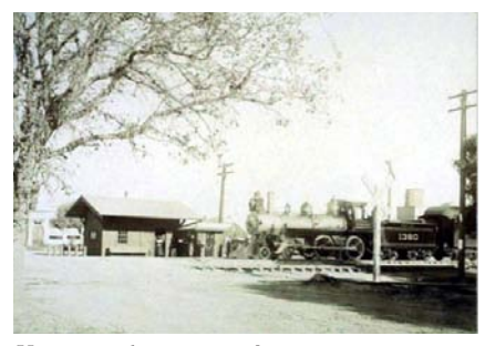
University Avenue train depot, 1895