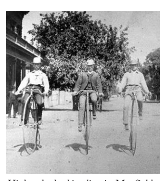
High-wheeler bicyclists in Mayfield, c. 1888