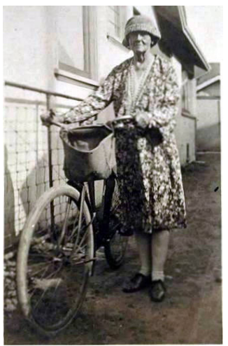
A 1920s safety bicycle with Alice Park.

While bicycling has continued to be a popular form of recreation and transportation in the Bay Area, the golden age of bicycling faded, in part due to the increasing popularity of the newest form of transportation, the automobile.